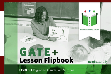
Level 1.8 Digraphs, Blends, & Suffixes